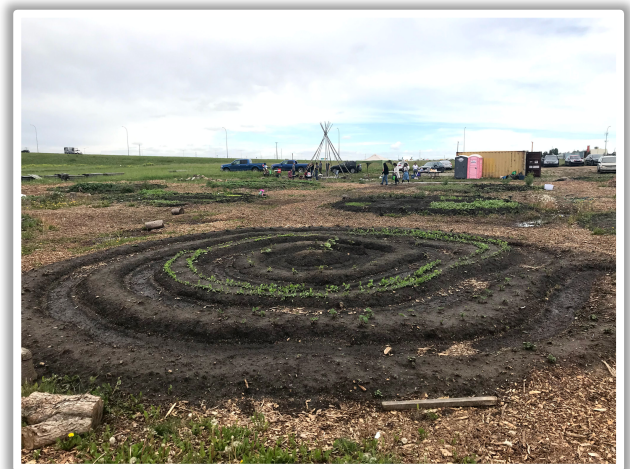
Miskanawah's Community Garden Plot