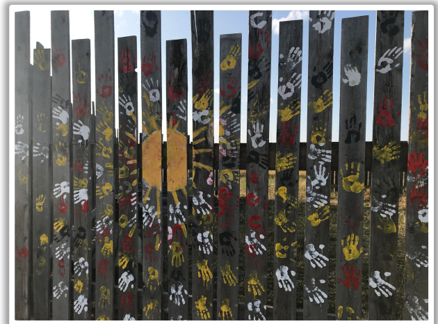
A community mural of the many helping hands

In partnership with the Calgary Catholic Immigration Society (CCIS), Miskanawah is excited to welcome families to the Land of Dreams! Located on Treaty 7 territory in Southeast Mohkinstsis (Calgary), the Land of Dreams project offers the unique opportunity to build connections between Indigenous peoples and newcomers through the development and cultivation of a community garden. The Land of Dreams is a meaningful space for Calgary newcomers to rekindle their roots and build a sense of community while learning about and appreciating Alberta's Indigenous history.